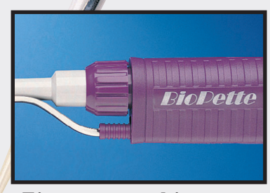
Ejector removal is a snap with the easy-grip handle