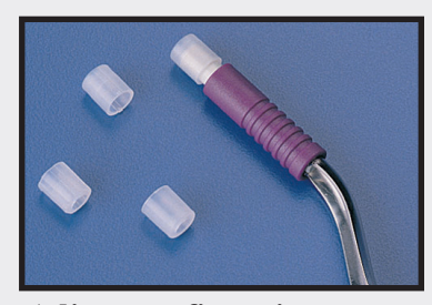
Adjusts to fit various types and brands of tips