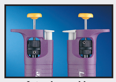
Interchangeable tip ejector buttons